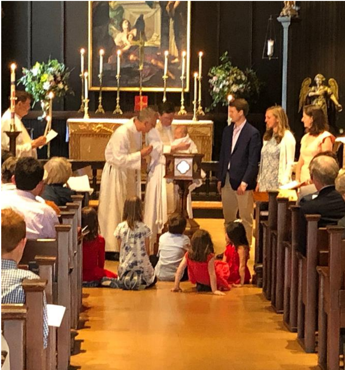
Baptism at St. Mary's

Newcomers and visitors, we welcome you warmly. May you find here, by the grace of God, that which feeds your soul. May you leave here with a heart prepared to serve.