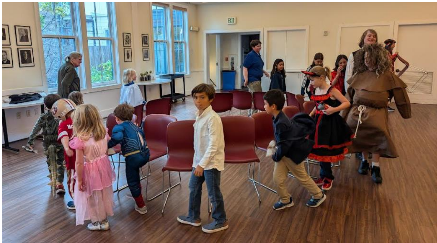
Photo from last week's Spooky Sunday Sunday, October 27, 2024

Newcomers and visitors, we welcome you warmly. May you find here, by the grace of God, that which feeds your soul. May you leave here with a heart prepared to serve.